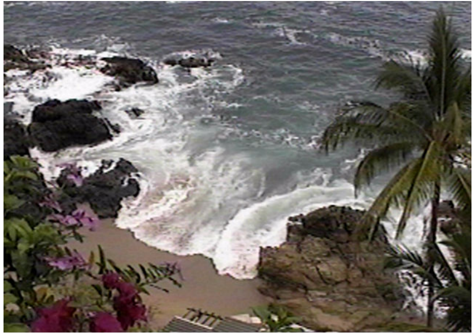
Looking down on the beach from the balcony of Lindo Mar in Puerto Vallarta.

We visited the beach at Mismaloya, where "Night of the Iguana" was filmed, and the isolated haunts of Chico's and Chinos Paradieses. ("Predator" was filmed just up the road from one of them.) Their out-of-the-way locations