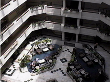
The lobby of Paradise Village.

We were presented early with one of many time-share purchase opportunities. It