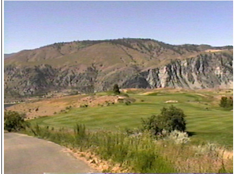
The 6th at Desert Canyon is a 698-yard killer.

geous, and it's a good thing since it helped us forget about our scores. We had so much fun that we started planning for next year's vacation before this one had ended.