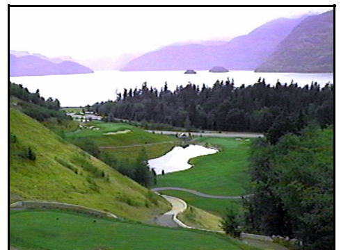
Spectacular Furry Creek Golf Course in B.C.

week we visited several of Washington's finest golf courses. Our own best could be the one built in the desert overlooking the Columbia River near Wenatchee — Desert Canyon. Once again the weather was gor-